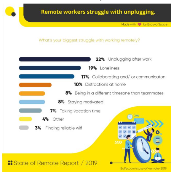
Figure 2. General drawbacks of the remote working