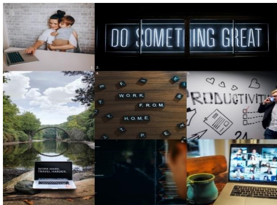
Figure 3. Remote working in images